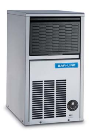
B 2006 AS/WS

Bar Line Equipment range is the newly released EU made ice makers for Thimble-shaped rounded ice cubes coming from Bar Line.