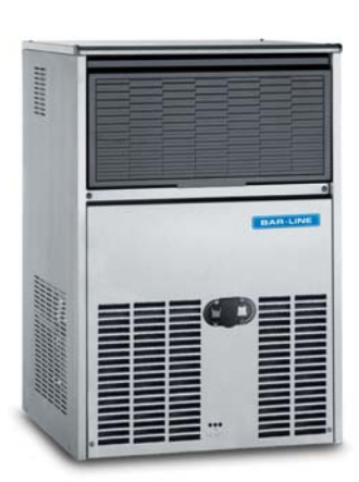
B 4015 AS/WS

Bar Line Equipment range is the newly released EU made ice makers for Thimble-shaped rounded ice cubes coming from Bar Line.