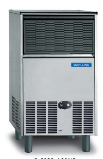
B 6022 AS/WS

Bar Line Equipment range is the newly released EU made ice makers for Thimble-shaped rounded ice cubes coming from Bar Line.