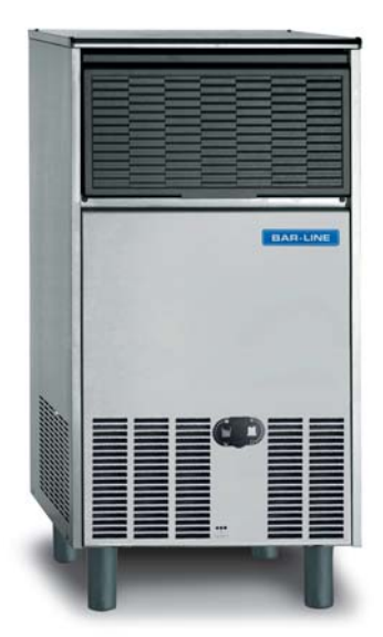
B 7540 AS/WS

Bar Line Equipment range is the newly released EU made ice makers for Thimble-shaped rounded ice cubes coming from Bar Line.