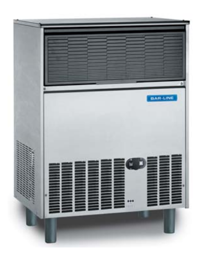
B 9040 AS/WS

Bar Line Equipment range is the newly released EU made ice makers for Thimble-shaped rounded ice cubes coming from Bar Line.